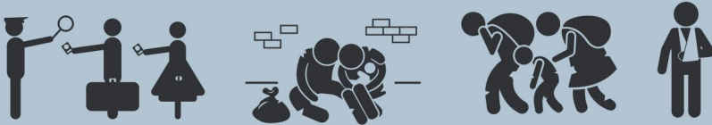
EXHIBIT FEAR, ANXIETY, DEPRESSION, SUBMISSIVENESS, TENSION, NERVOUSNESS

LOOK UNCOMFORTABLE IN EXPENSIVE/ FLASHY CLOTHES, ACCESSORIES OR SHOES